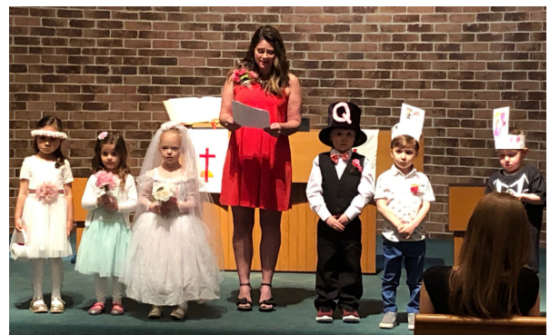
The Wedding of Q and U